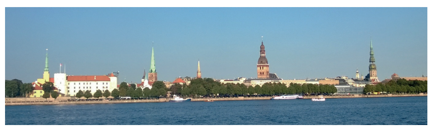
Riga from the River Daugava

Please visit the conference site for more information http://baltmattrib2016.lmpb.lv and site of Latvian Materials Research Society http://lmpb.lv/en/author/lmpb We look forward to seeing you in Riga!