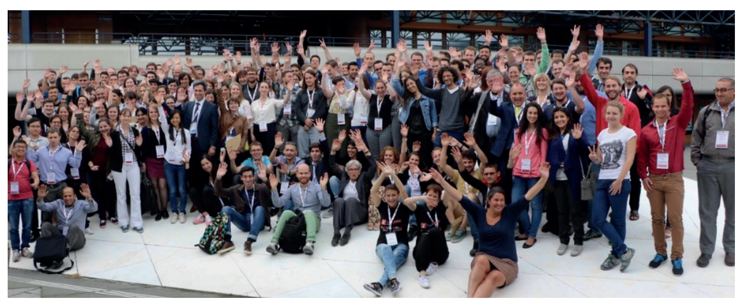
Delegates together at the last day of the conference