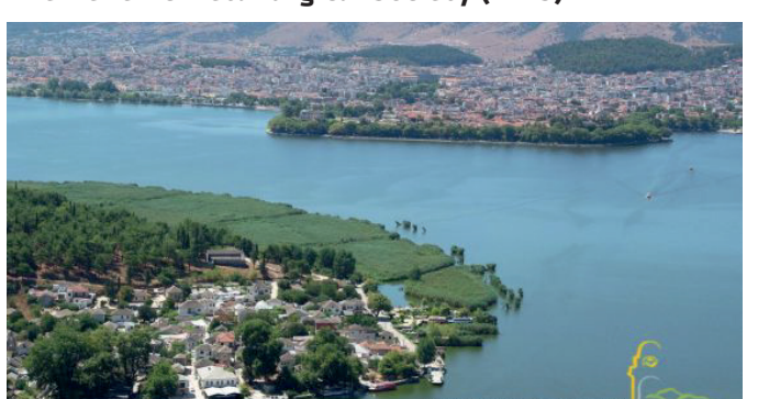
City of Ioannina: Panoramic View

The 6th Panhellenic Conference on Metallic Materials, will be held in Ioannina Greece on 7-9 December 2016. The Conference is Co-organized by the Laboratory of